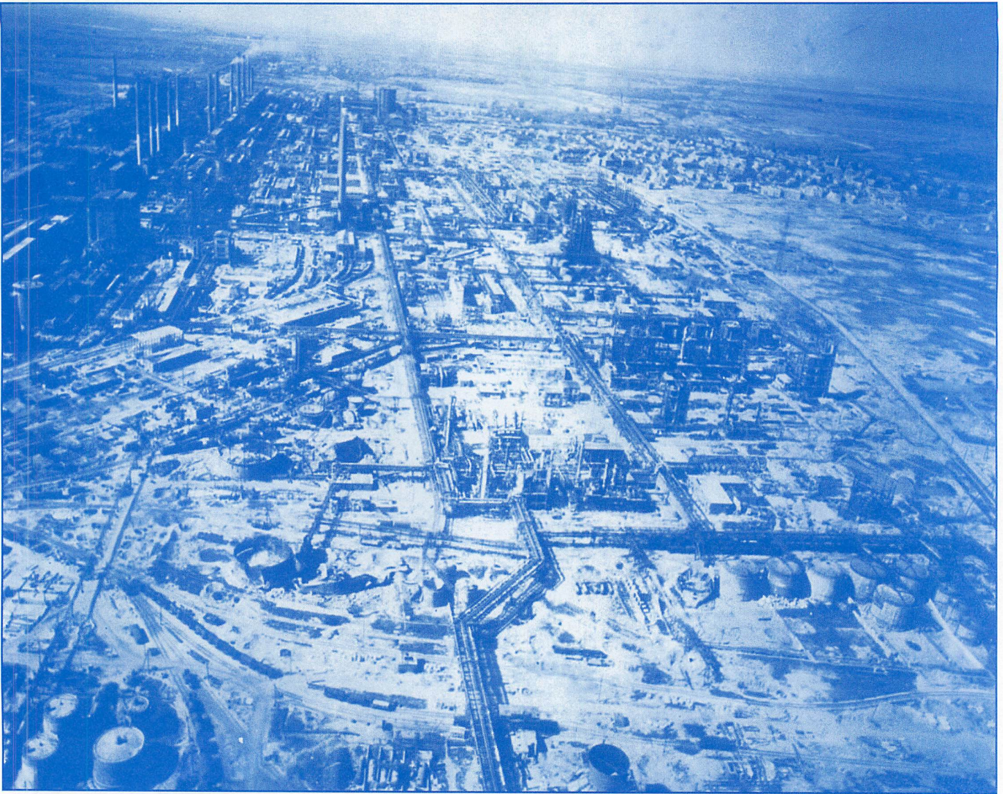
The bomb damage at Leuna Synthetic Oil Refinery at Merseburg, Germany May 12, 1945.