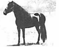
Paso Fino Horses