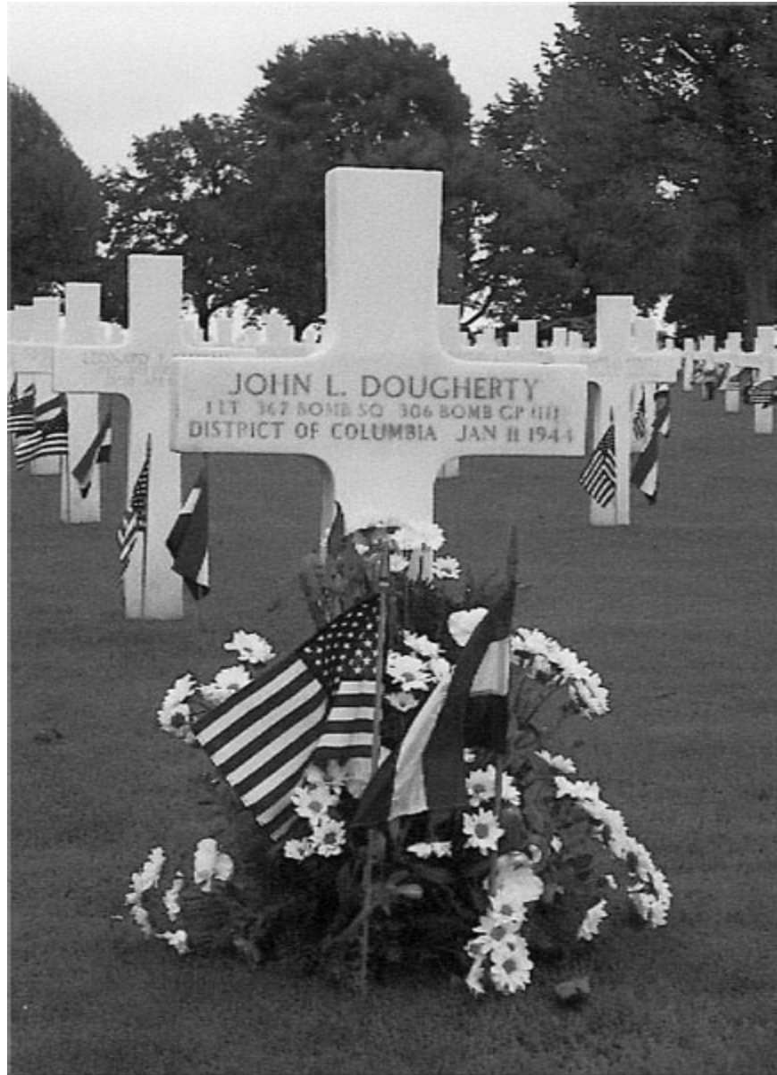
Jack's grave in Netherlands American Cemetery