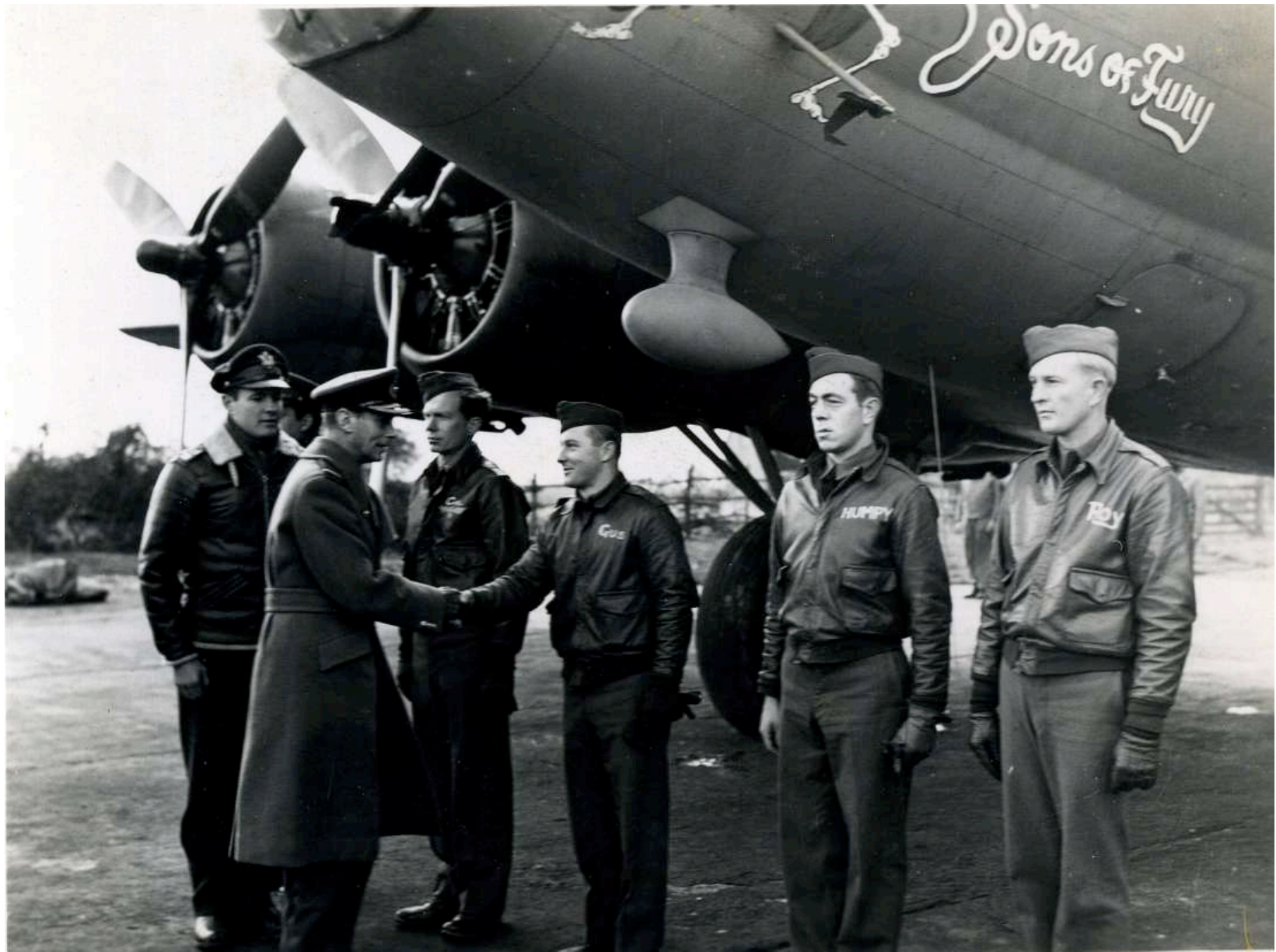
Royal Visit, King George VI