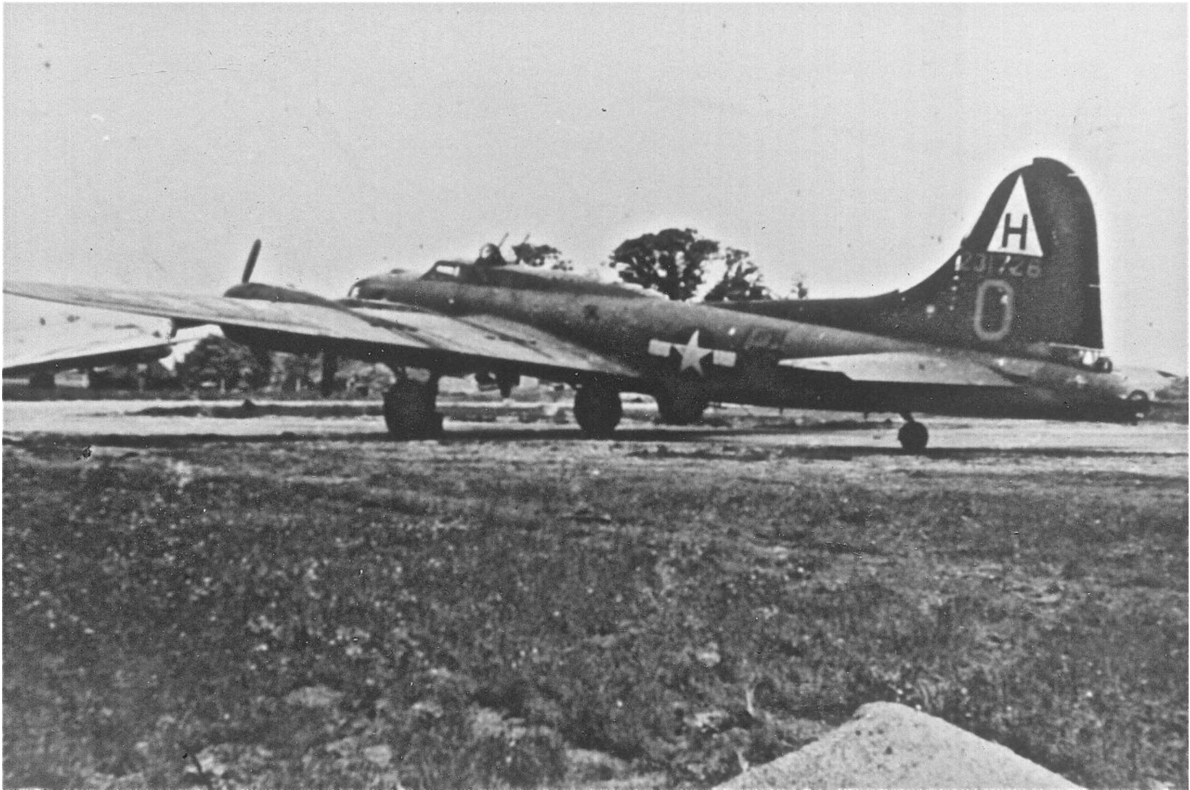
42-31726 'Duration Plus' model B-17G-25-B0 lost 13 February 1944, target Merseburg