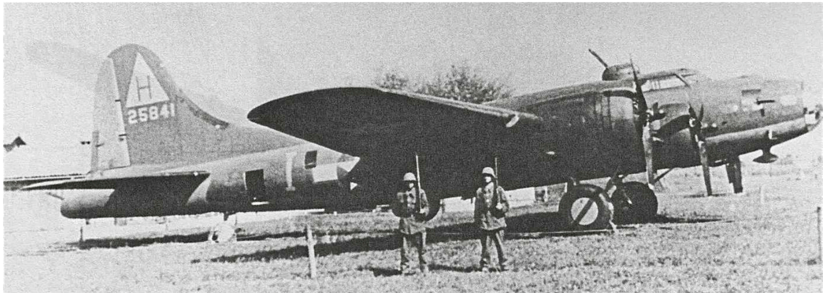
interned in Switzerland (Swiss guards)