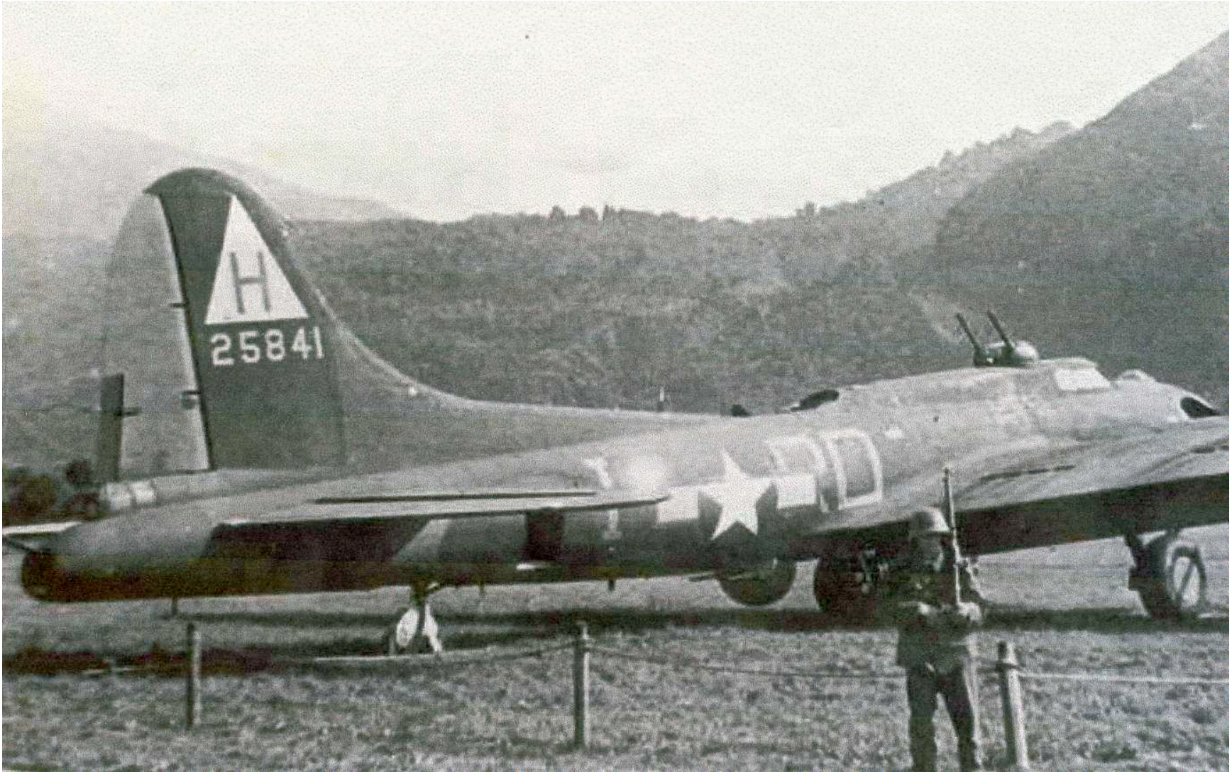
interned in Switzerland (Swiss guards)