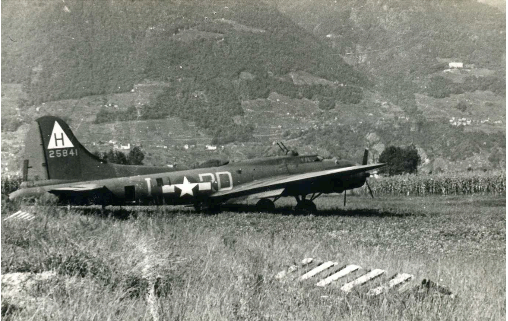
interned in Switzerland