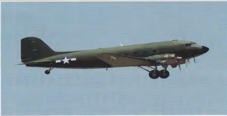
Pictured above is a Normandy Veteran C47 which flies with the Liberty Foundation.

The journey through the mansion includes the