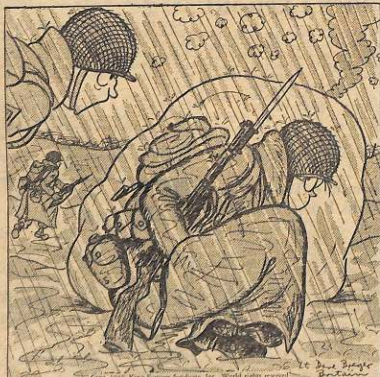
"Well, well! All curled up on a rainy afternoon! Maybe you'd like a good book, too?"