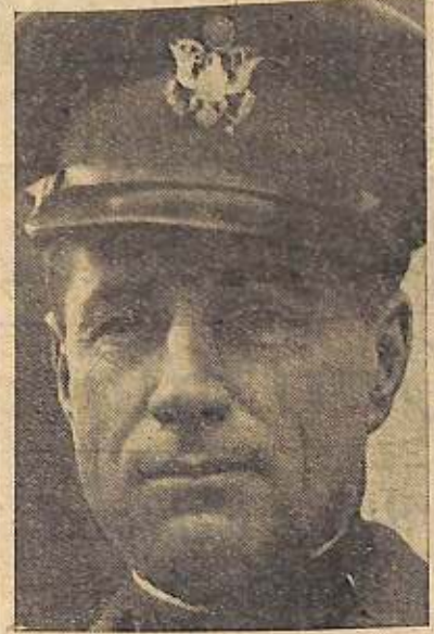
Gen. William L. (Billy) Mitchell Died eight years ago today.

William Mitchell was a Spanish war soldier and officer almost before he began to shave. He served with the Signal Corps under Arthur MacArthur—the present general's father—in the Philippine campaign. He went to Alaska to string communications, and while he was there built two box kites to carry telephone wire; the box kites, he found, could pick him off the ground, and that's as good an