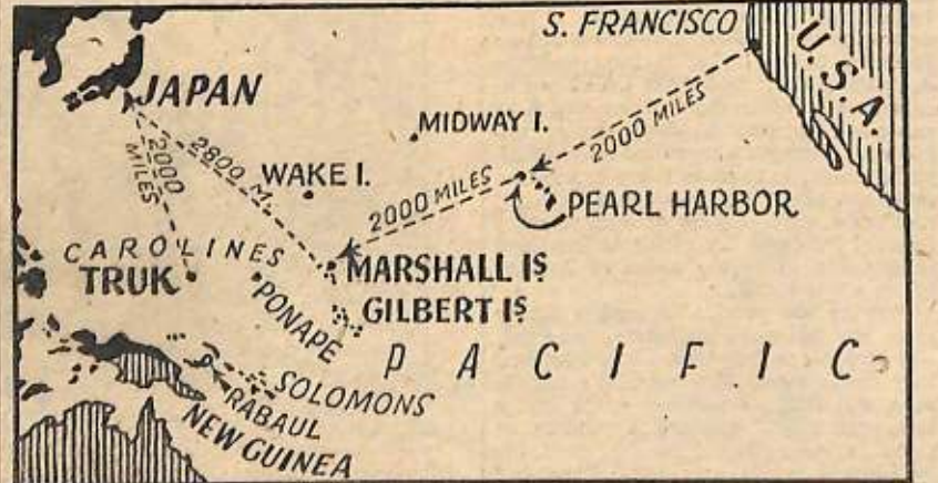
Evening News Map.

When I was there only one break in the reef surrounding the islands was large enough for ocean-going steamers, but other entrances may have been deepened since, although the number is probably limited for defense reasons. The lagoon inside the reef is big enough to anchor the entire Japanese navy.