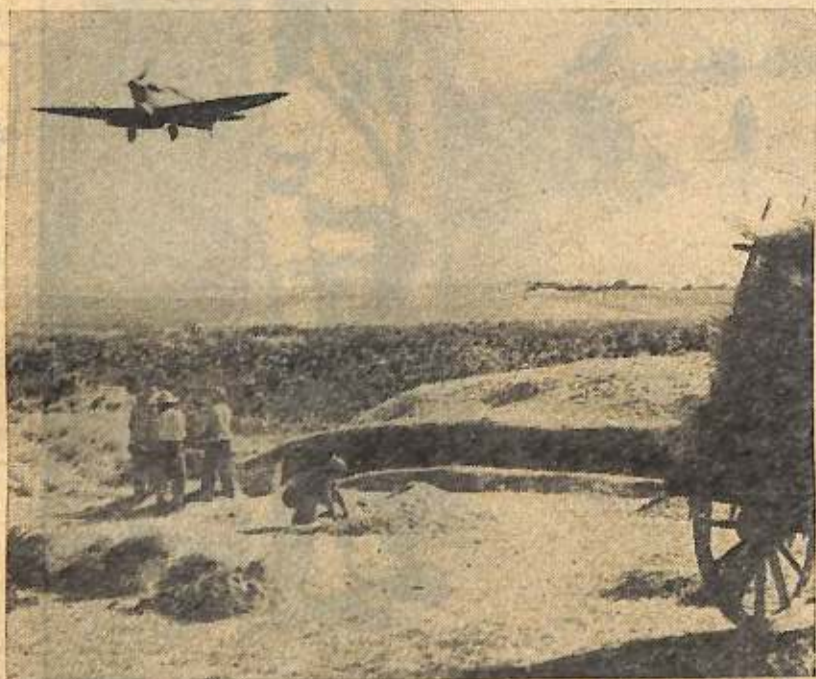
Sicilian farmers pause from their wheat harvesting task as a British Spitfire takes off for a sweep over Axis-held territory.