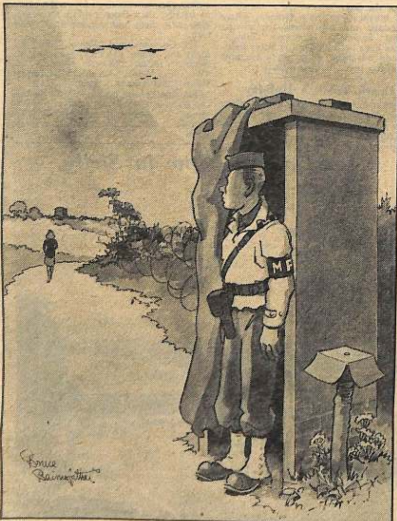
Total War—and of course this was her only free evening this week.

And while we seek no new honors for Chairborne troops, we can sympathize with the one who recently remarked: "Oh for the peace of the battlefield" . . . for, brother, he was speaking true words, very true indeed.