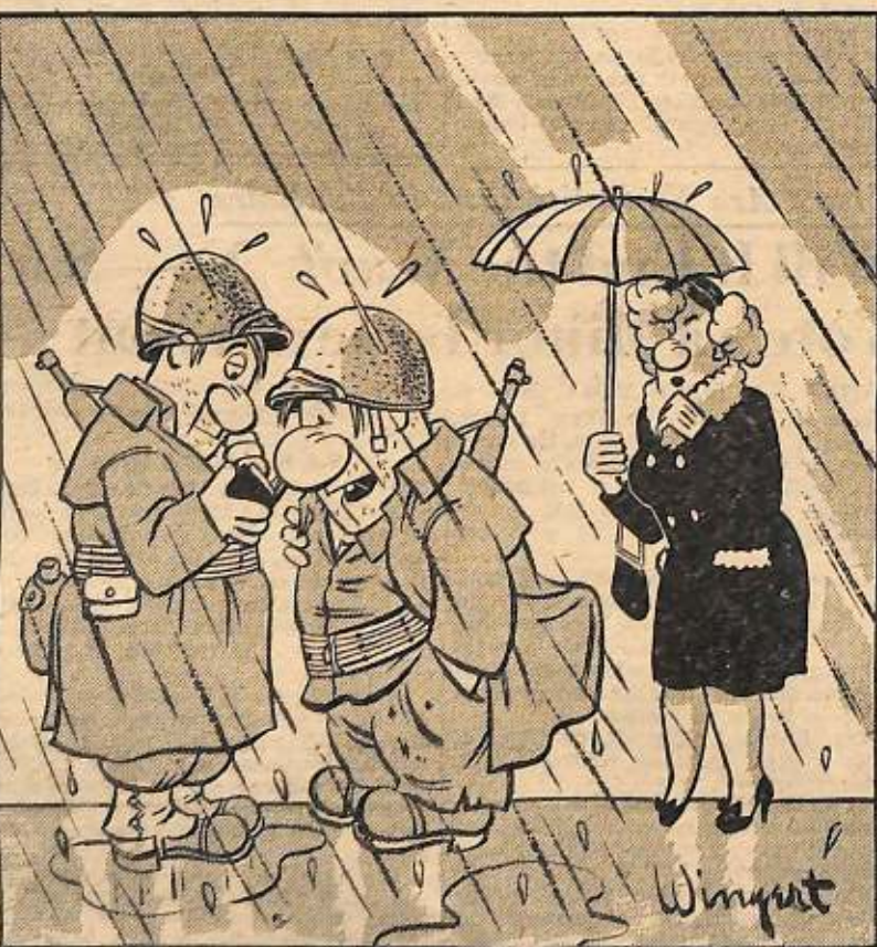
"I said yooly-voos-promenade-aw-vec-mwa, and she said wee-wee. Now what do I do?"