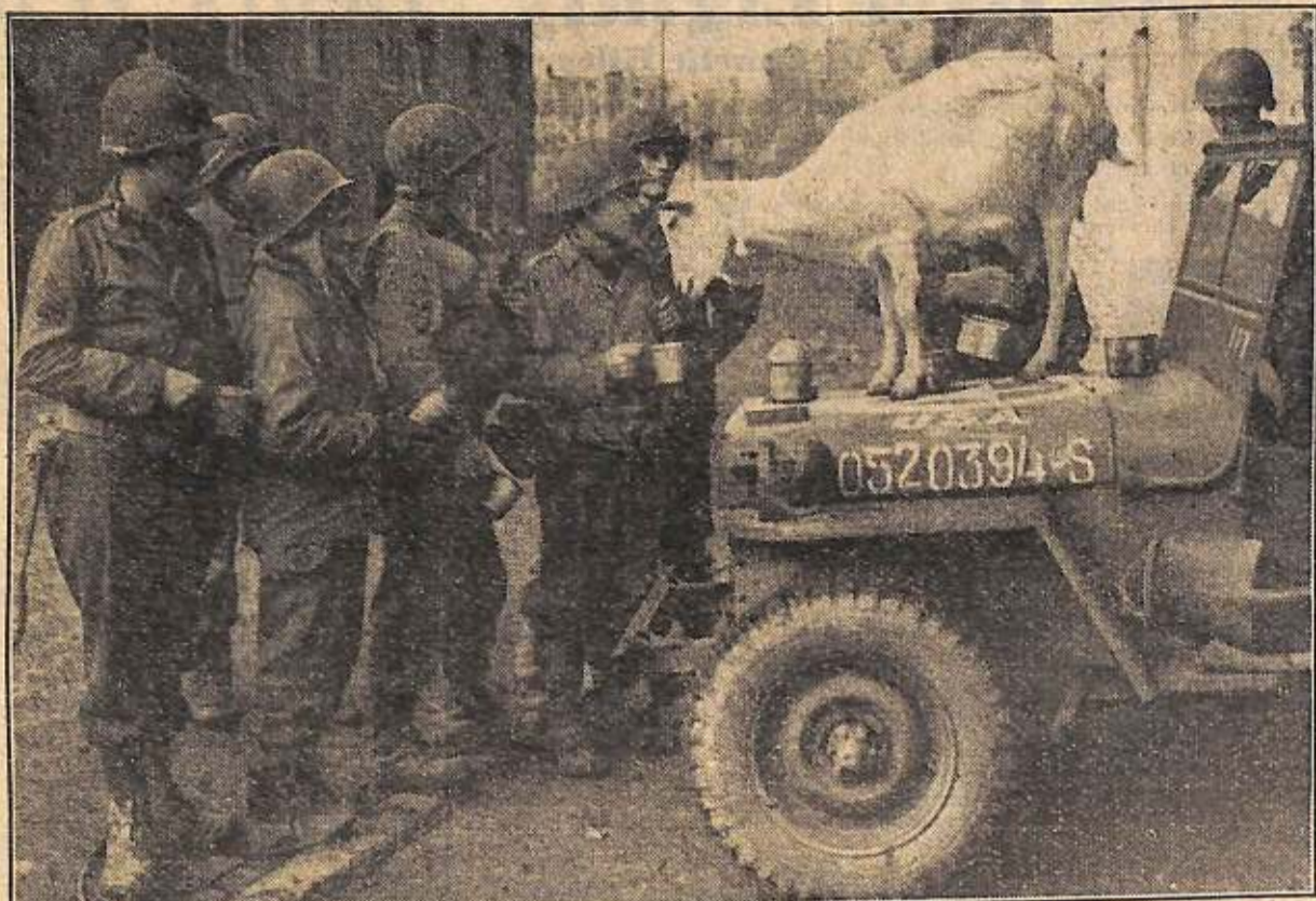
Fritz, an ex-Nazi goat deserted by her former owners, now is providing milk for U.S. troops who feed her in a front-line German town. Twice a day Fritz is milked by members of a mortar platoon, while the rest of the men line up for their ration.